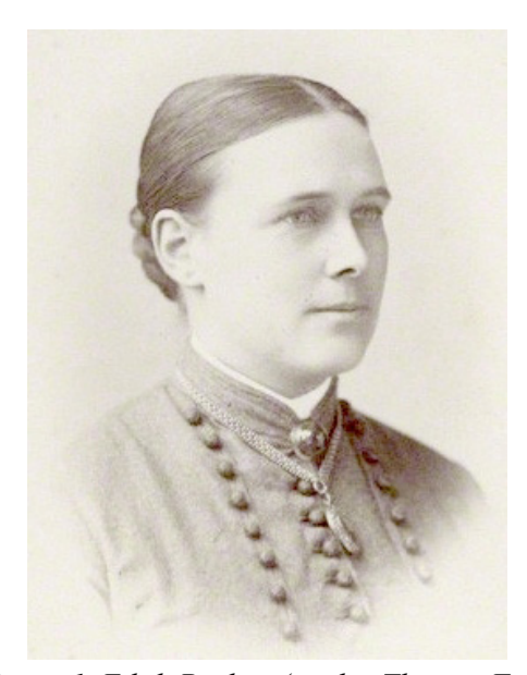
Figure 1. Edith Pechey

indenture route in 1865. Worried that other women might follow Garrett, in 1867, the Court of Examiners of the Apothecaries announced that they would no longer accept privately-tutored applicants. As women were barred from attending formal lectures, Pechey's route to a pharmacy-related career was firmly blocked.